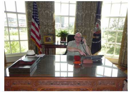
Working from the Oval office today